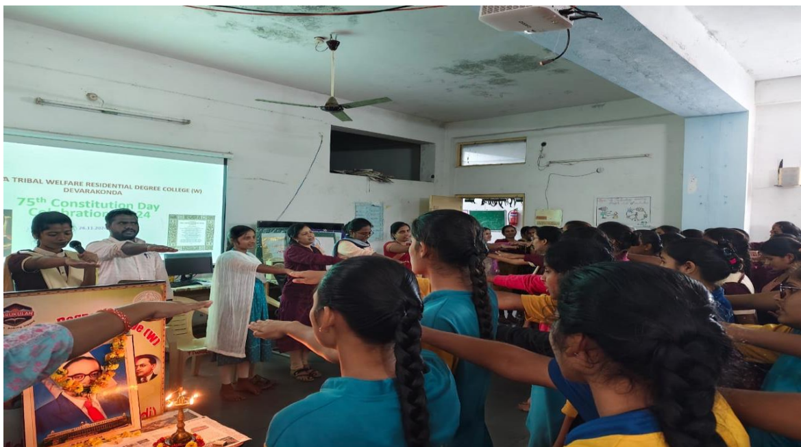
Taking the Pledge of Preamble On Constitution Day Celebrations