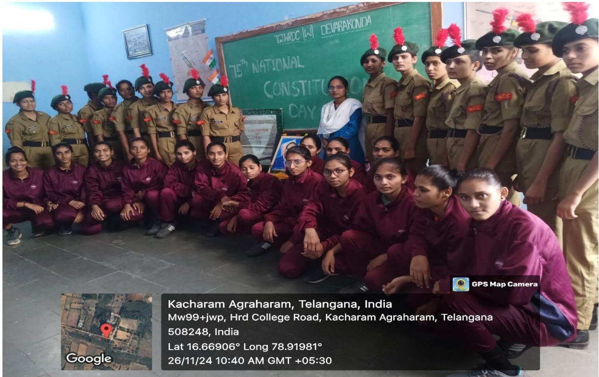
The NSS team tributed and remembered the efforts of the Constitutional fathers