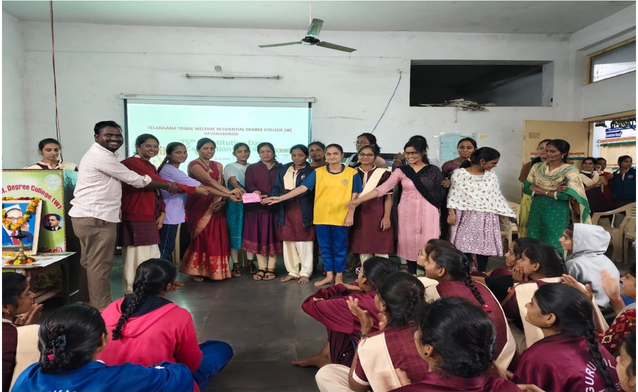
Prize Distribution to Quizz Winner's team on Constitution Day