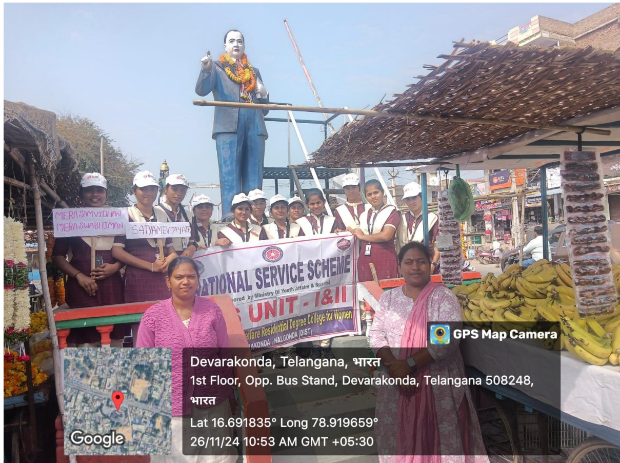
NSS wing Conducted a Rally from college to the Ambedkar statue at Devarakonda

Constitution Day served as a platform to educate, inspire, and engage the community in meaningful discussions about the Constitution's role in shaping the nation. The event concluded with a vote of thanks and a resolve to continue fostering constitutional values in daily life.